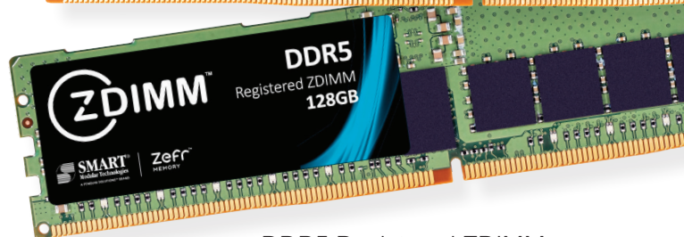
DDR5 Registered ZDIMM