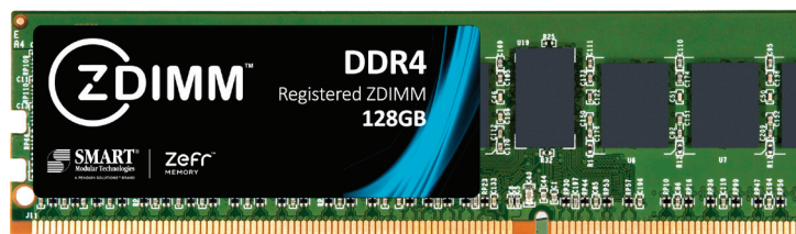
DDR4 Registered ZDIMM

ZDIMMs are Zefr-processed Registered DDR4 and DDR5 SDRAM DIMMs with <200 DPPM.